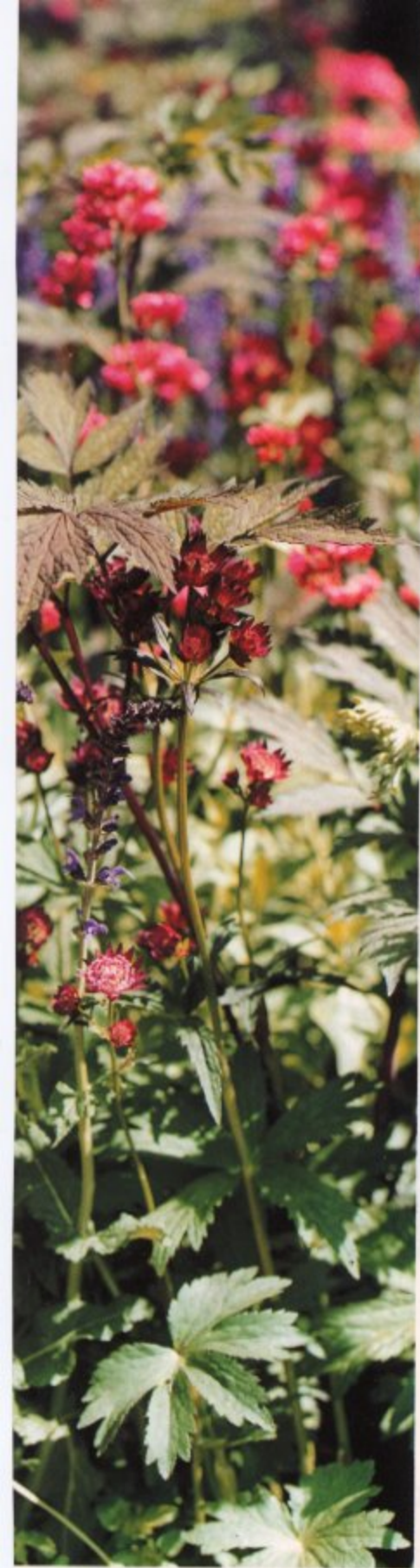
ABOVE: SALVIA X SYLVESTRIS 'MAINACHT', ASTRANTIA 'CLARET' AND THE BRONZE LEAVED CIMICIFUGA VAR. SIMPLEX ATROPURPUREA GROUP. TOP: THE RIPPLE POOL, FRINGED BY DESCHAMPSIA CESPITOSA .